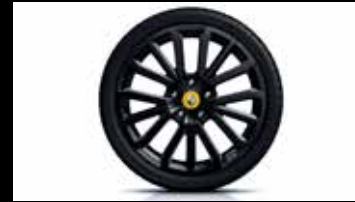
18" Black Renault Sport alloy wheel with Liquid yellow caps