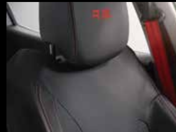
Renault Sport upholstery in dark carbon cloth with red stitching and R.S logo on front headrest